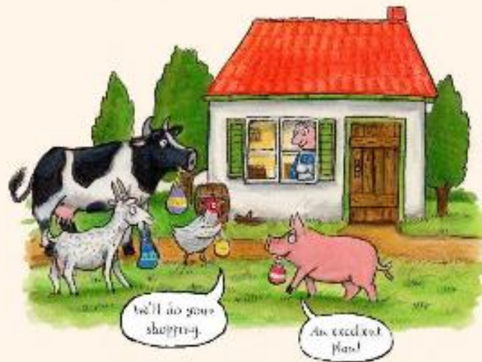
Illustration: © 2015 Scholastic Teaching Resources. All rights reserved. Scholastic Teaching Resources. All rights reserved.

"Stay in your house," said the wise old man.