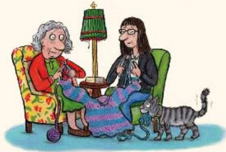
Illustration by David Roberts. © 2003 by the author. All rights reserved.

Prunella and Pat are safe in their flat, Being looked after by Tabby McTat.