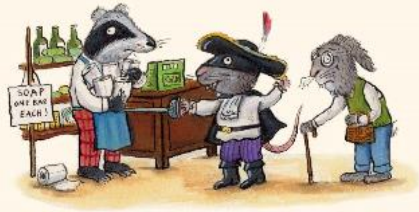
Illustration by David Roberts. © 2003 The Gruffalo Book by Julia Donaldson and David Roberts. All rights reserved.

"Give me your soap and your loo rolls And everything else on the shelf. For I am the Rat of the Highway And I'm taking them all for myself."