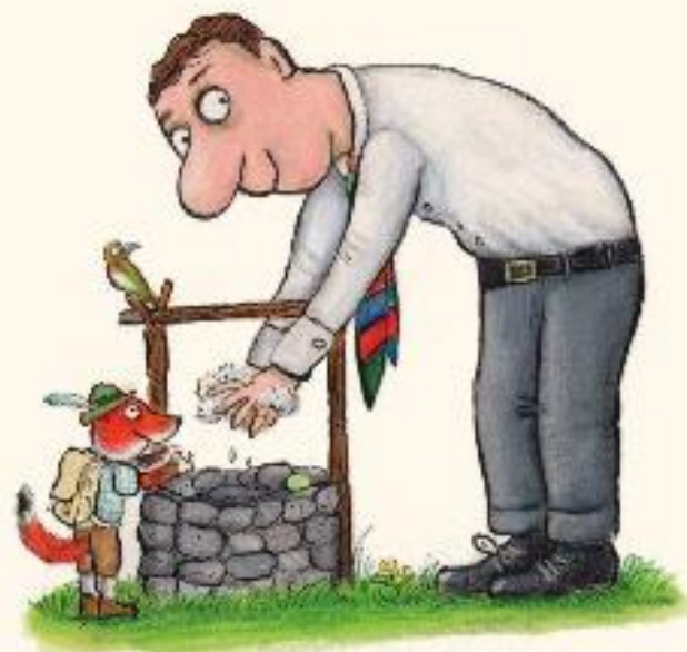
Illustration by David Roberts. All rights reserved. © 2015. All rights reserved. © 2015. All rights reserved.

Look me up and down, I'm the cleanest giant in town!